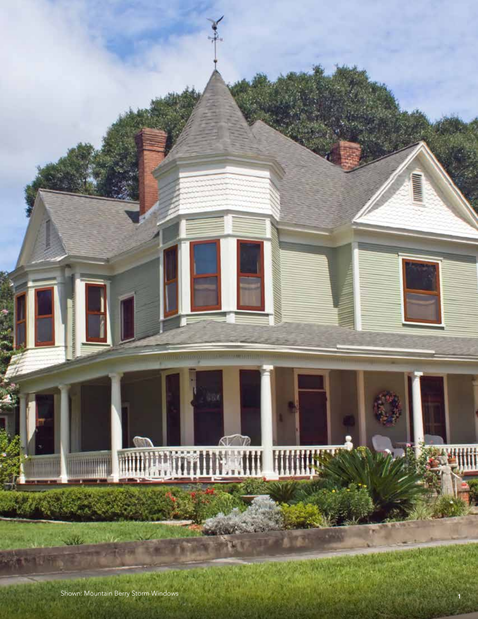
Shown: Mountain Berry Storm Windows