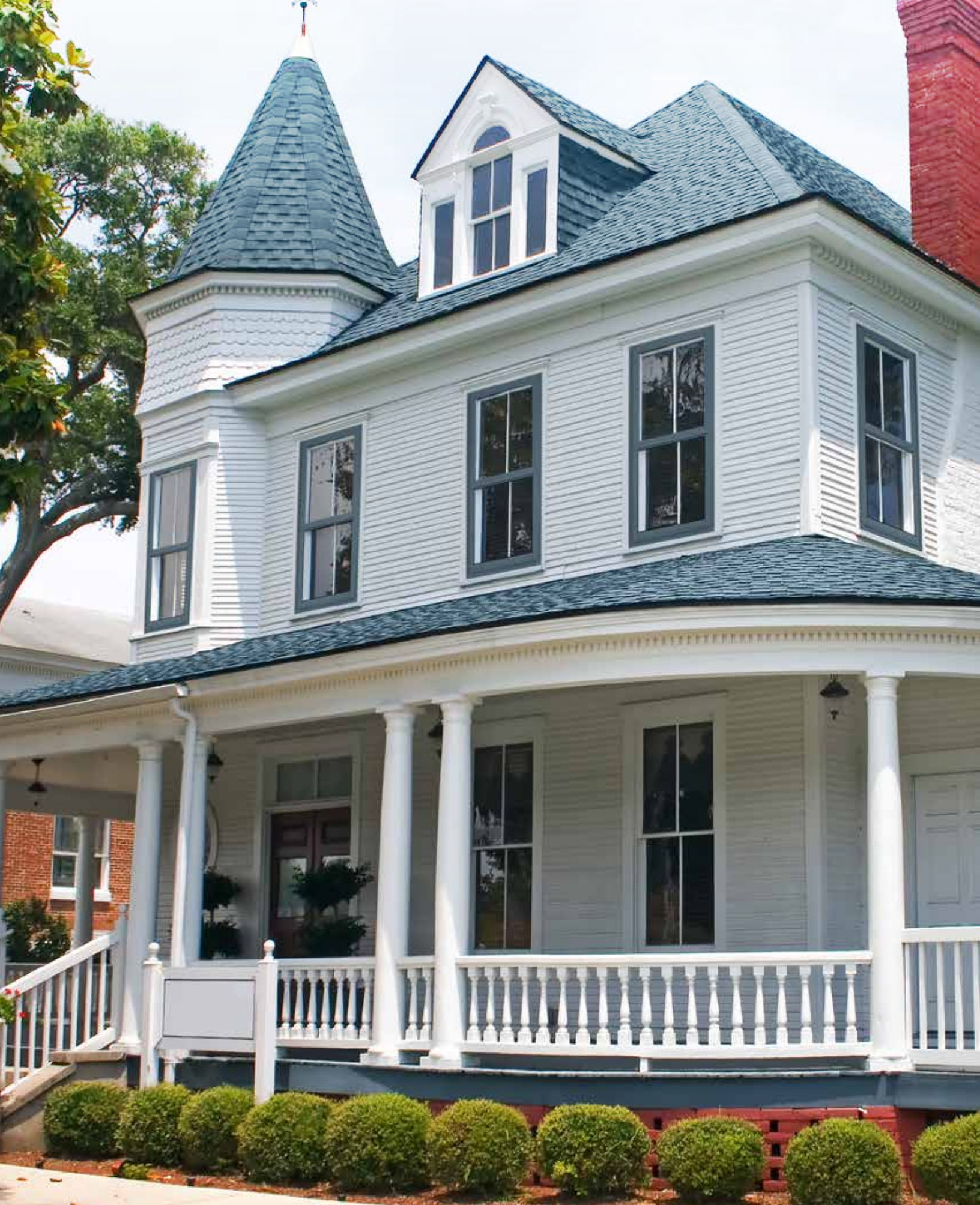
Shown: Enzian Blue Storm Windows